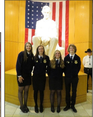
Above: The Ohio Historical Society recognized Fredericktown FFA with the 1st Ohio Historical Landmark Sign for an article of clothing (Sept 2018)